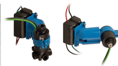
G75-LDO | assembled with G75-A operator & solenoid

For further technical information, please refer to product page in Solenoid Valves | Special purpose section.