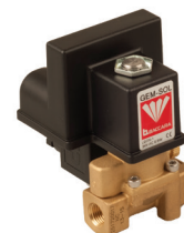
LD0S32 (LDOS) assembled with S32 (GEM-S) solenoid

For further technical information, please refer to product pages in Solenoid Valves | Special purpose section.