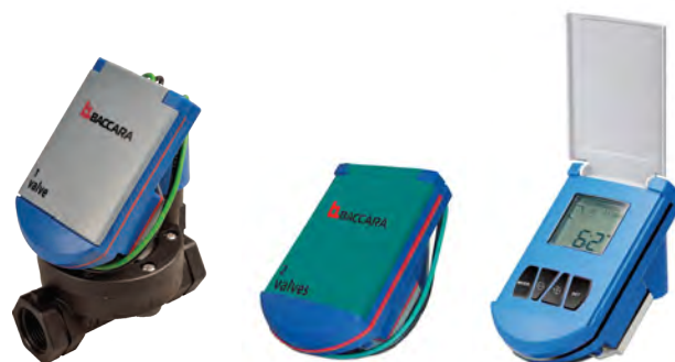
G75 One Valve